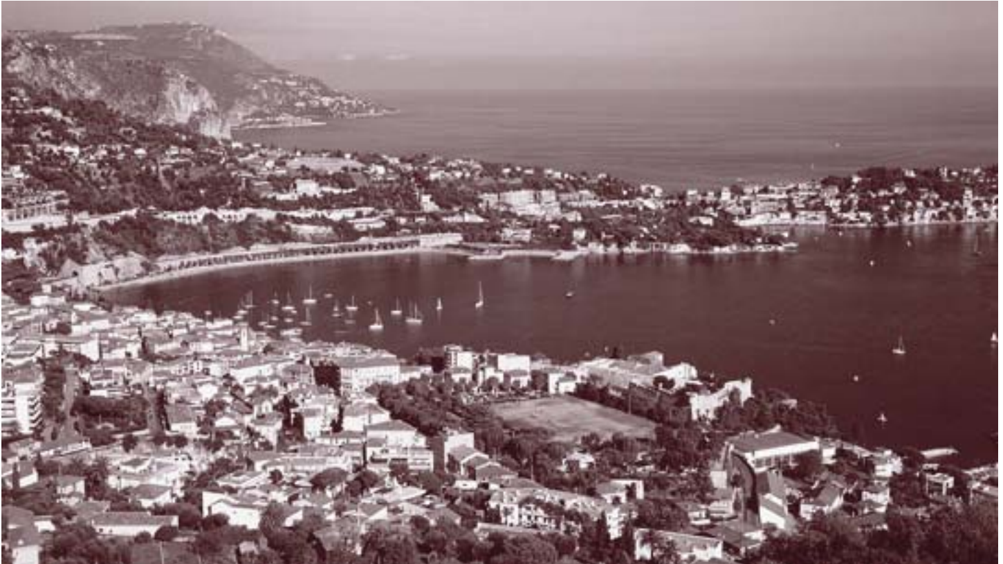
Villefranche sur Mer — French Riviera

dedicated to the study of French language and cultural exchange between Americans and French speaking peoples